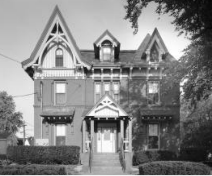
VETERAN'S MANSION, HAVERHILL