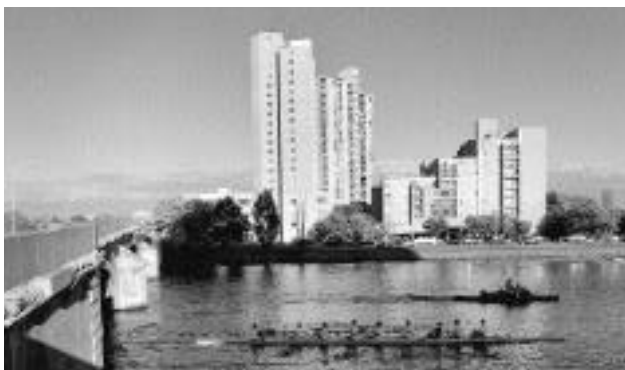
808 MEMORIAL DRIVE, CAMBRIDGE