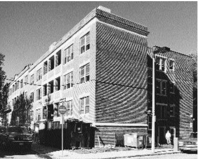
WILDER GARDENS, DORCHESTER

ONCE preliminary financing commitments are secured, CEDAC will lend additional funds to cover the costs of advanced design work, appraisals, environmental testing, and project management expenses. With the Massachusetts Housing Partnership Fund, CEDAC has also developed an Acquisition Loan Program, which makes loans to developers to buy sites if they must purchase them before all the project’s financing can be secured.