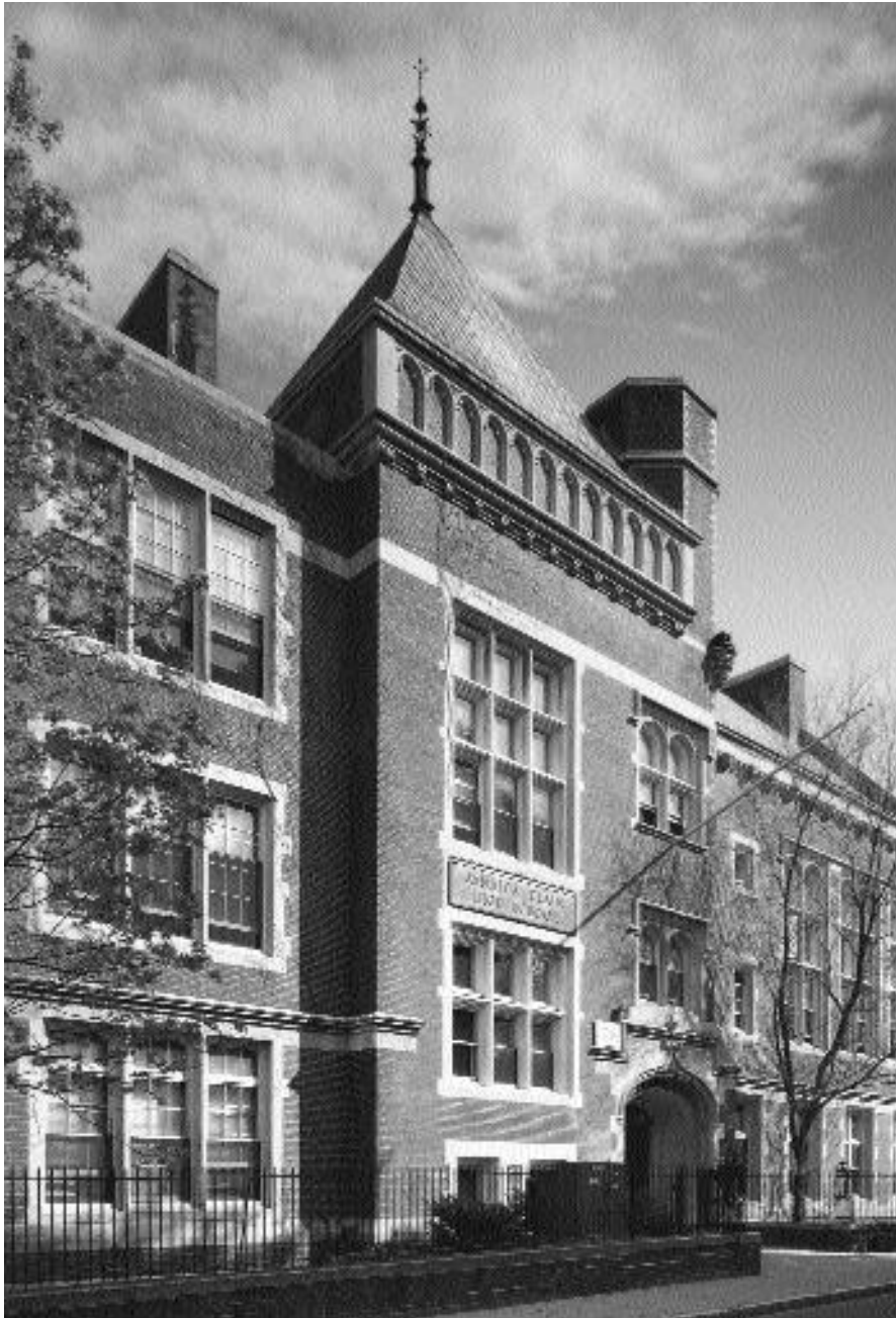
SUMNER HILL HOUSE, JAMAICA PLAIN

the genesis of CEDAC lies in the Southwest Corridor: the swath of land through Boston's South End, Roxbury, and Jamaica Plain neighborhoods which had been cleared in preparation for the construction of an extension of Highway 95. Community activists pressed the Commonwealth to reverse its policy of highway expansion, and substitute the upgrading of mass transportation mechanisms instead. Their goals achieved on that front, the communities turned their focus to the question of how to re-build the neighborhoods torn apart by the land clearance.