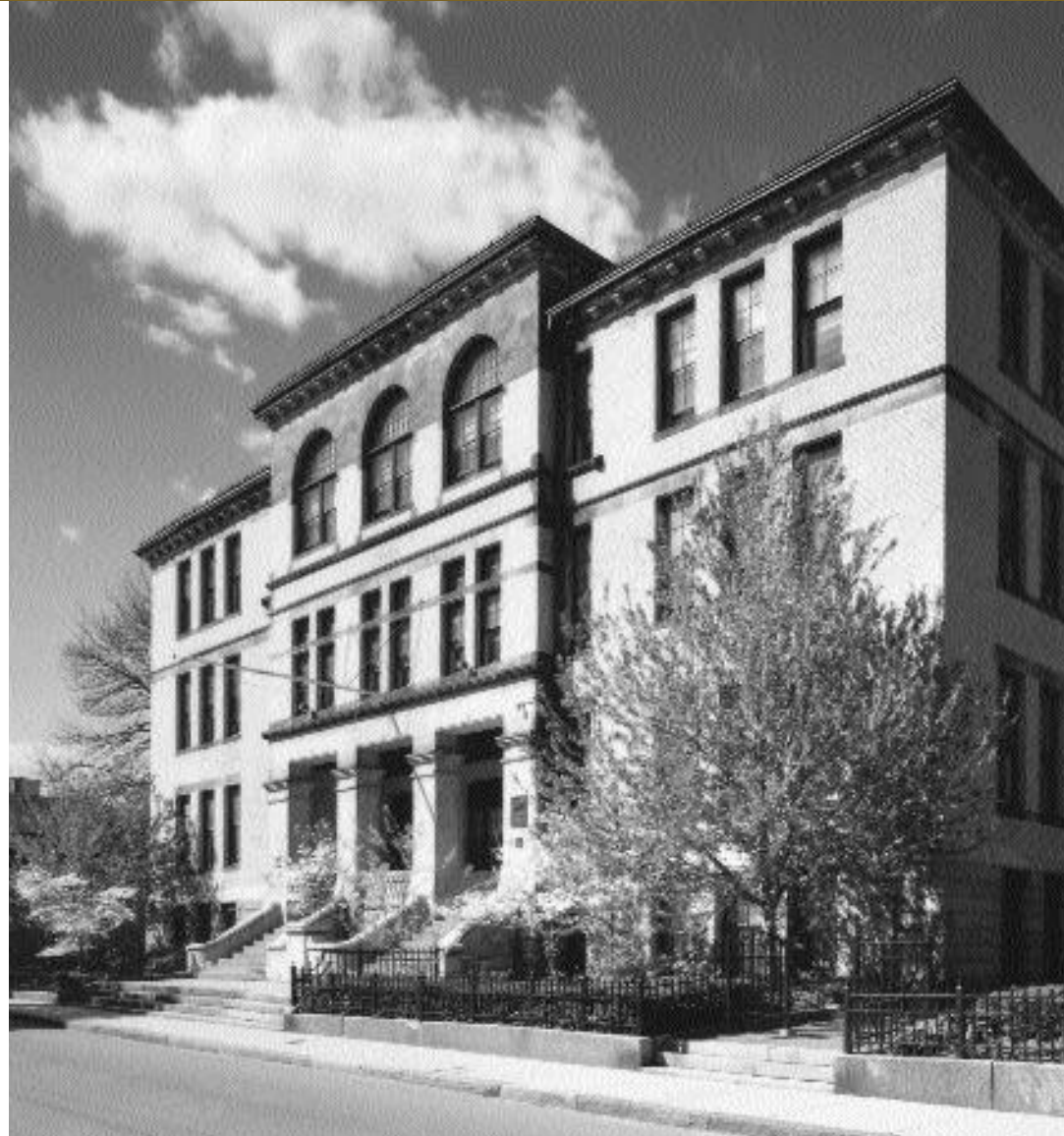
BOWDITCH SCHOOL, JAMAICA PLAIN