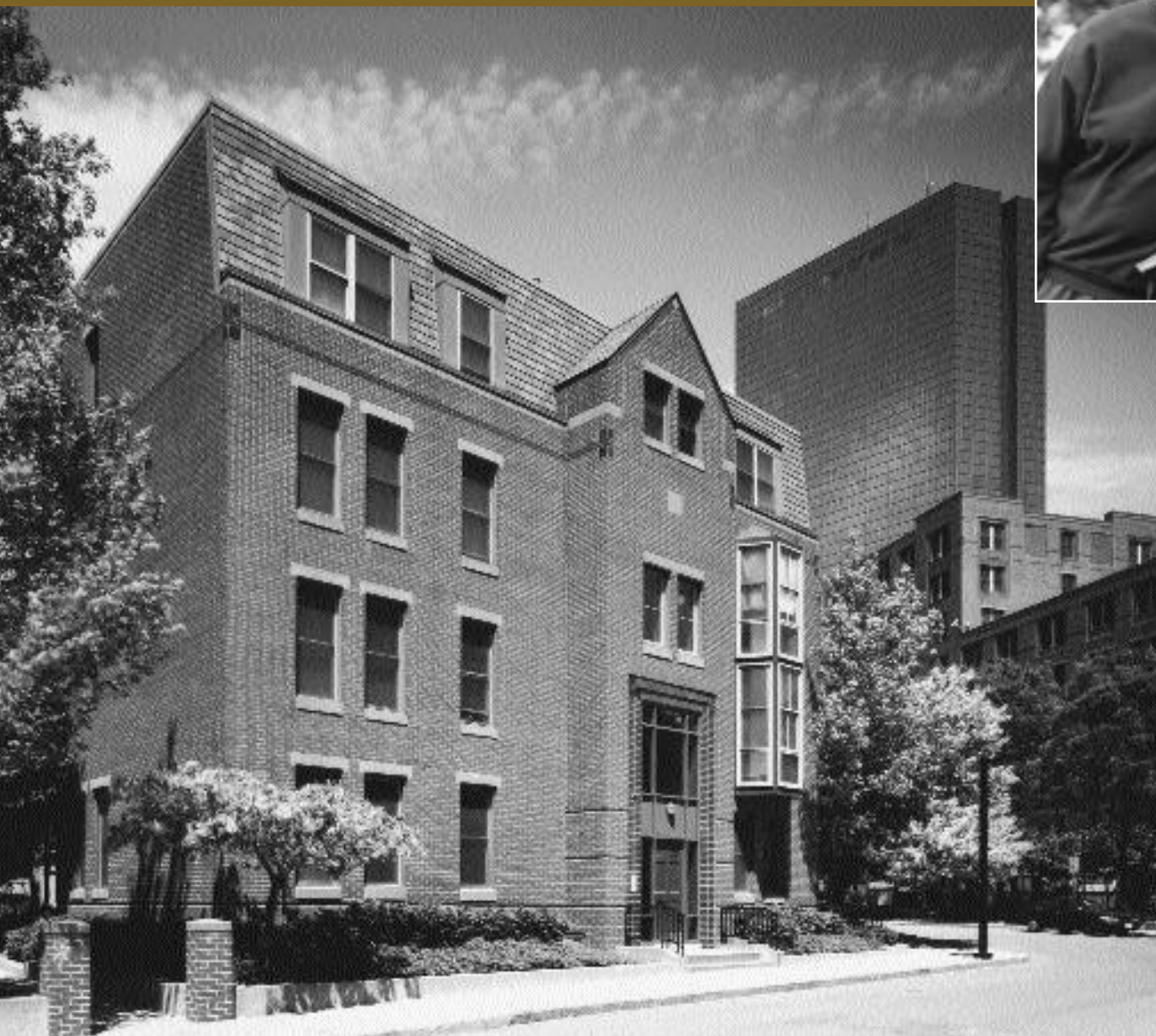
TENT CITY, SOUTH END