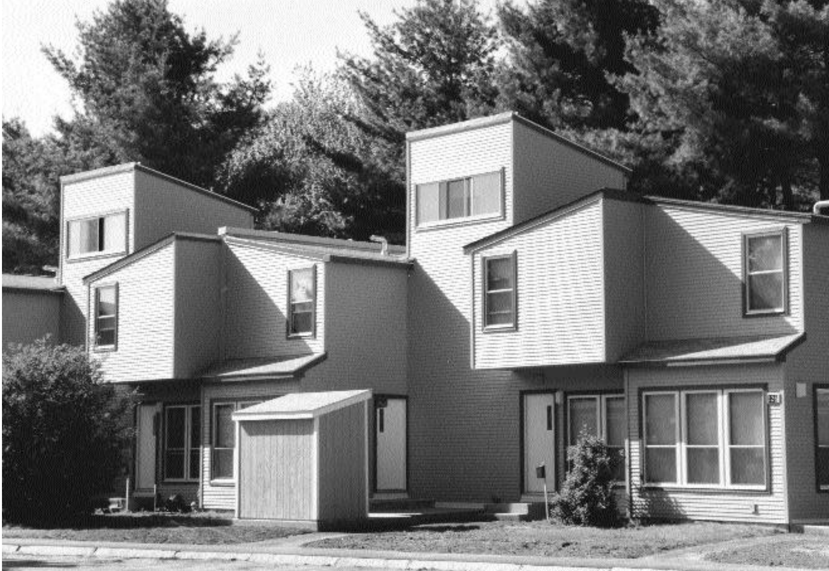
SPRING MEADOW APARTMENTS, SPRINGFIELD

not every resident group should own its development: most rental housing is better owned and managed by professionals in the field. But where previous ownership has demonstrably failed, and residents can show the pragmatic ability to grapple with the challenges of creating a democratic ownership structure and building a team of trusted advisors around them, resident ownership has proven to be an effective solution to the problems of housing which no one else could solve. Over the intervening fifteen years, CEDAC has facilitated the sale of more than 4,000 units of federally-assisted housing to resident and non-profit owners. ▼