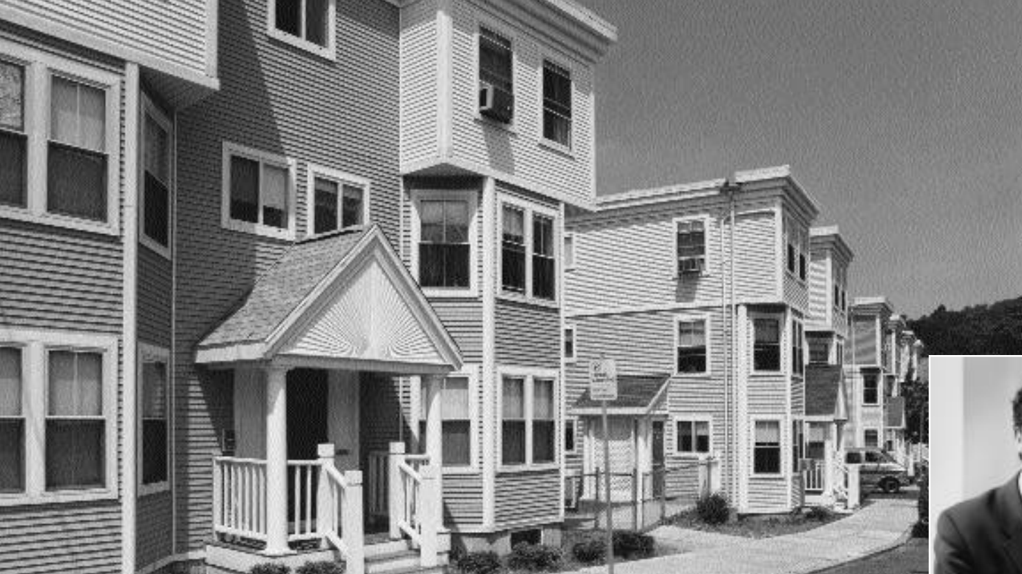
HYDE SQUARE COOPERATIVE, JAMAICA PLAIN