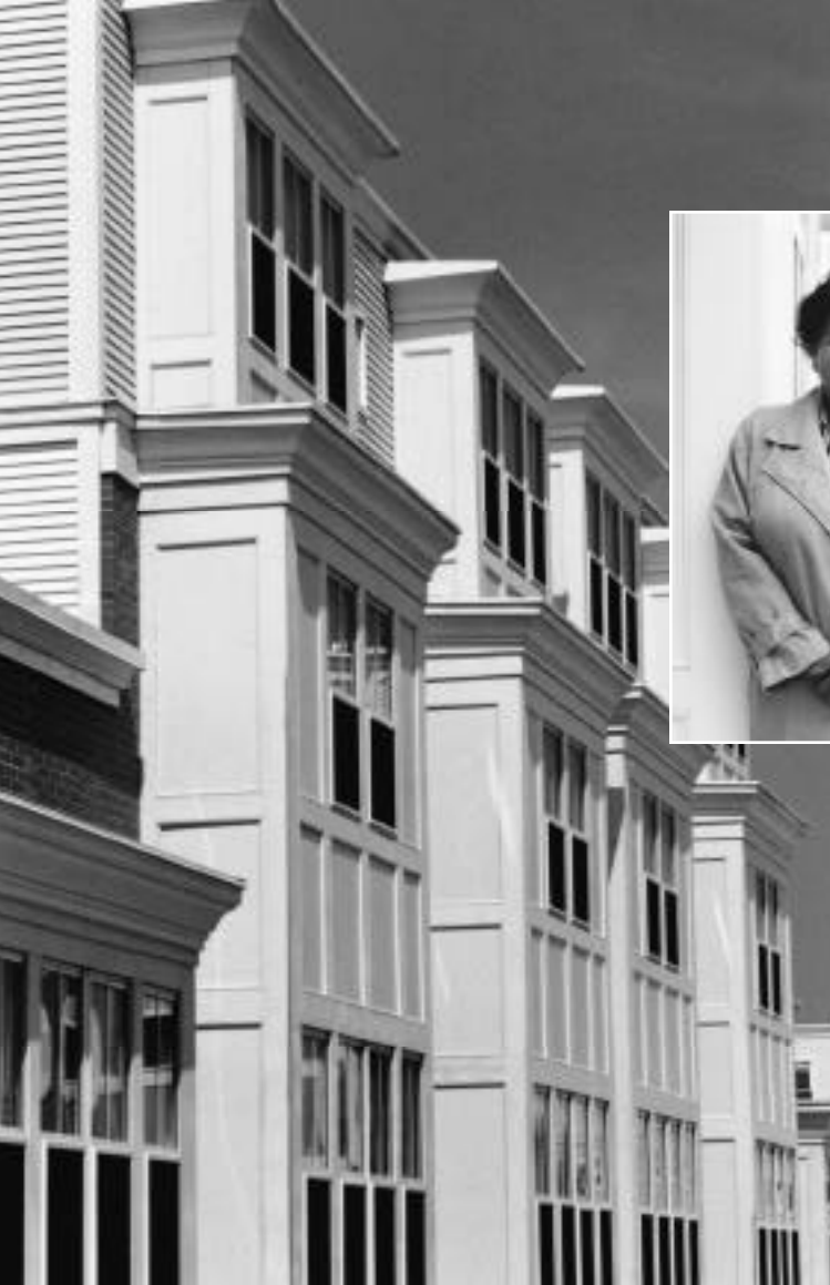
CAMFIELD GARDENS, ROXBURY

SO many monuments exist to the determination and dreams of two decades ago: Tent City, the exemplary mixed-income housing that rose from vocal protest on a parking lot. The complete makeover of Camfield Gardens, Roxse Homes, and Grant Manor, distressed federally-assisted housing in need of a massive infusion of capital to provide decent housing. Langham Court, the beneficiary of the bold thrust by the city of Boston to direct the benefits of its downtown commercial boom to build housing in the neighborhoods. Madison Park Village, a model inner-city community offering housing for the elderly, families seeking rental and ownership options, and radically made-over public housing.