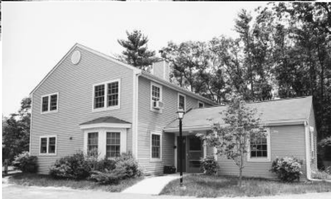
SOUTH SHORE HDC GROUP HOME, KINGSTON