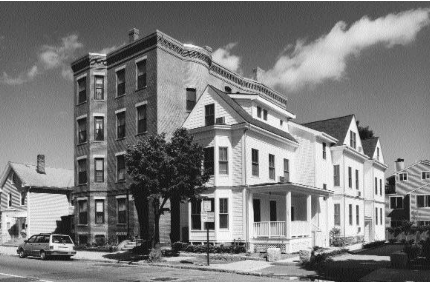
WESTERN AVENUE, CAMBRIDGE

but one of the growing trends in low-income housing over the last fifteen years has been the growing need of many individuals and families not just for decent, affordable shelter, but for a support system of services to help them achieve their broader human potential. The psychic trauma of homelessness, whether a by-product of the process of de-institutionalization, or the result of not having enough income to provide a stable home, requires more than temporary, or even permanent, shelter. The state's network of non-profit developers and social service providers has tackled the challenge of integrating services and housing into the package defined as 'service-enriched housing.'