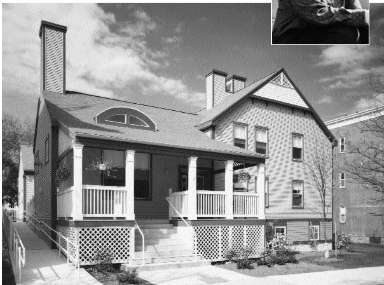
WOODWARD PARK, DORCHESTER