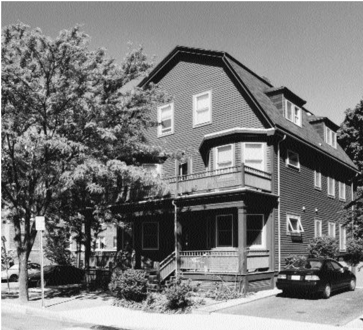
MAGAZINE STREET, CAMBRIDGE

cedac has helped non-profit developers build and renovate thousands of units of housing for individuals and families who simply don't earn enough income to pay the rent or mortgage payment on an adequate home. That housing is relatively straightforward: you build it, they rent or buy it, and you manage it. But one of the growing trends in low-income housing over the last fifteen years has been the growing need of many individuals and families not just for decent, affordable shelter, but for a support system of services to help them achieve their broader human potential.