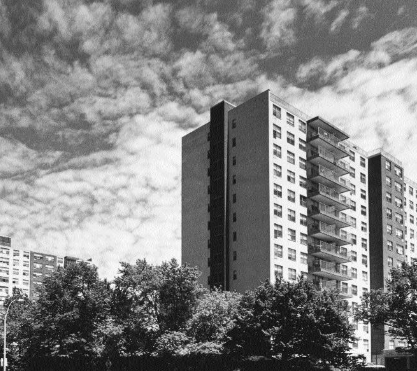
CLARENDON HILL TOWERS, SOMERVILLE