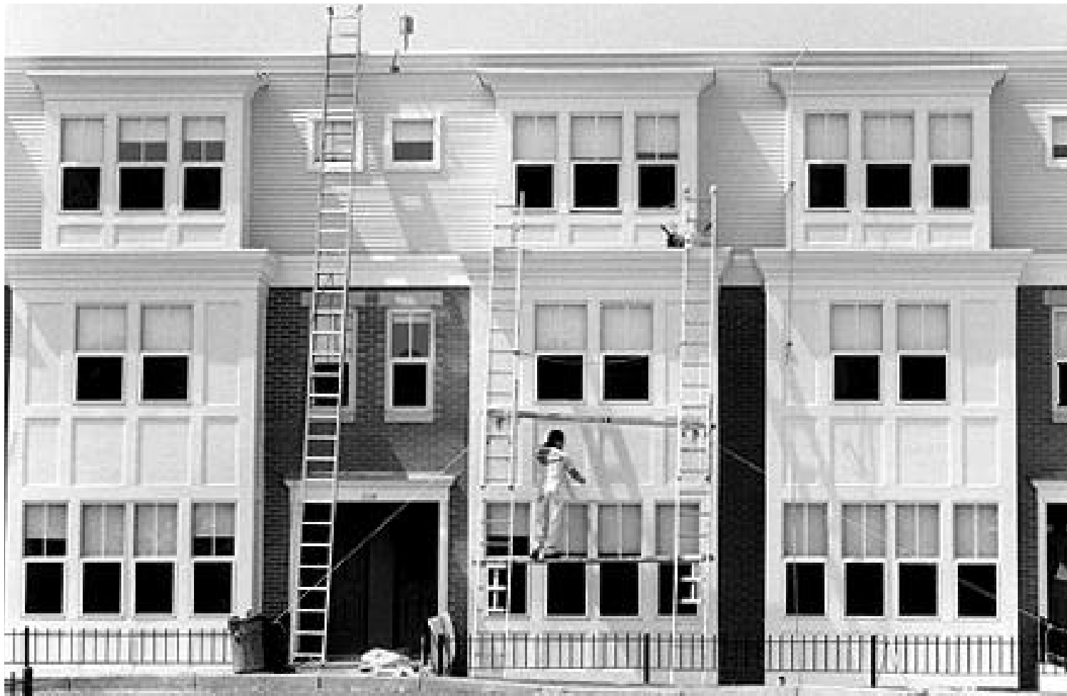
CAMFIELD GARDENS, ROXBURY: FINISHING TOUCHES

and further out along the Corridor, Stony Brook Gardens, the cooperative housing painstakingly assembled as the first concrete evidence of the turnaround for the Corridor land in Jamaica Plain. Jackson Square, with the siting of the first new full-service supermarket in the inner city and a new community health center for the area's residents. The Nate Smith House, elderly housing for Jamaica Plain's burgeoning Latino community, which exorcised the worst vestige of slum housing in the neighborhood. All this, and more to come, driven by a vision of what was possible, unfettered by conventional wisdom. ▼