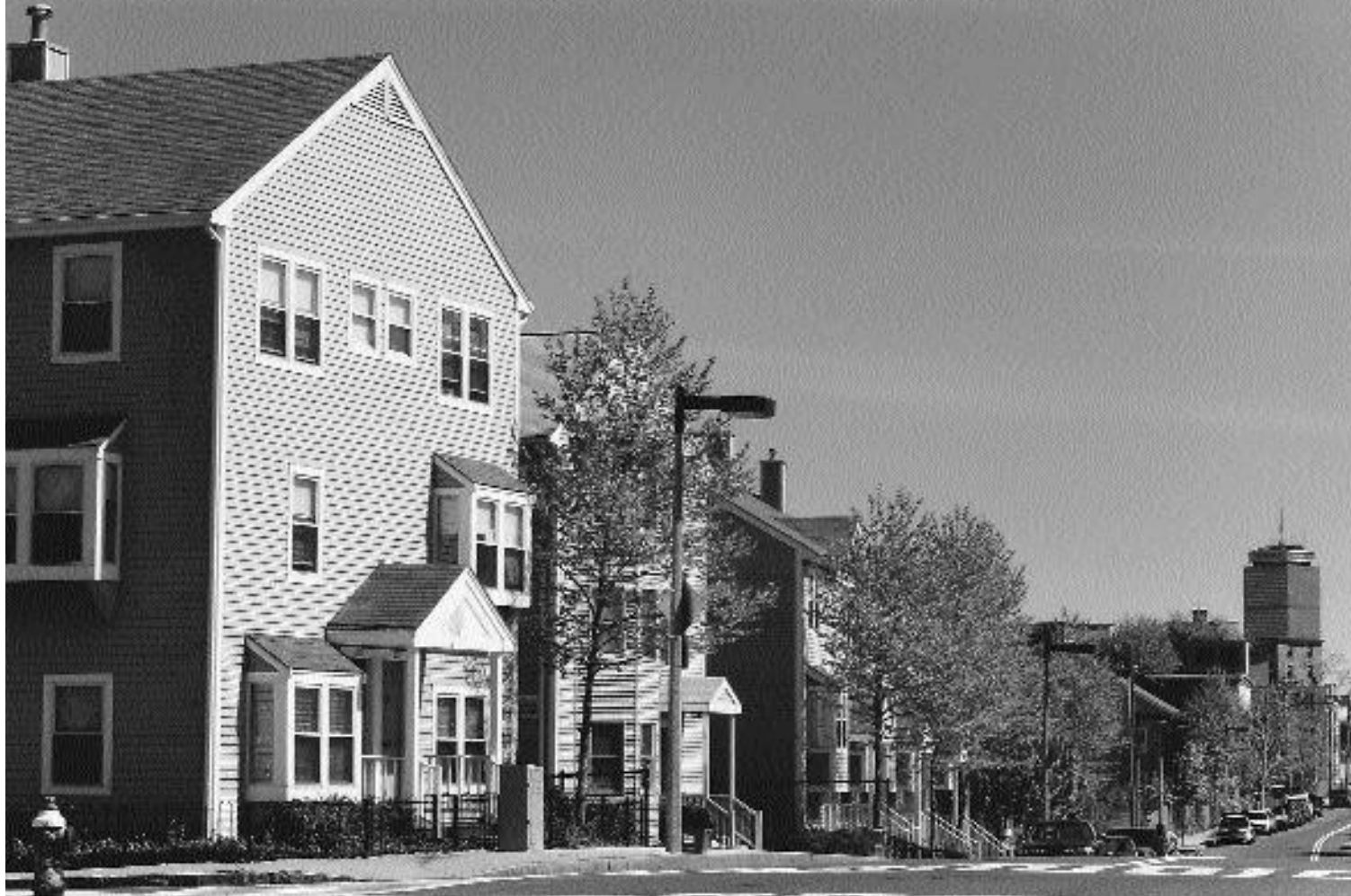
STONY BROOK GARDENS COOPERATIVE APARTMENTS, JAMAICA PLAIN

in the intervening two decades, the Commonwealth, the city of Boston, the neighborhoods, their leaders, their institutions, and non-profit community developers have collectively transformed the Southwest Corridor. All along the Corridor, from its origin nearest downtown to its terminus in Jamaica Plain, the development of new housing, commercial space, park land, and educational and institutional facilities have re-knit the fabric of those communities. Conspicuous, key parcels yet remain to be addressed, but an enormous amount of what was dreamed twenty years ago is reality today.