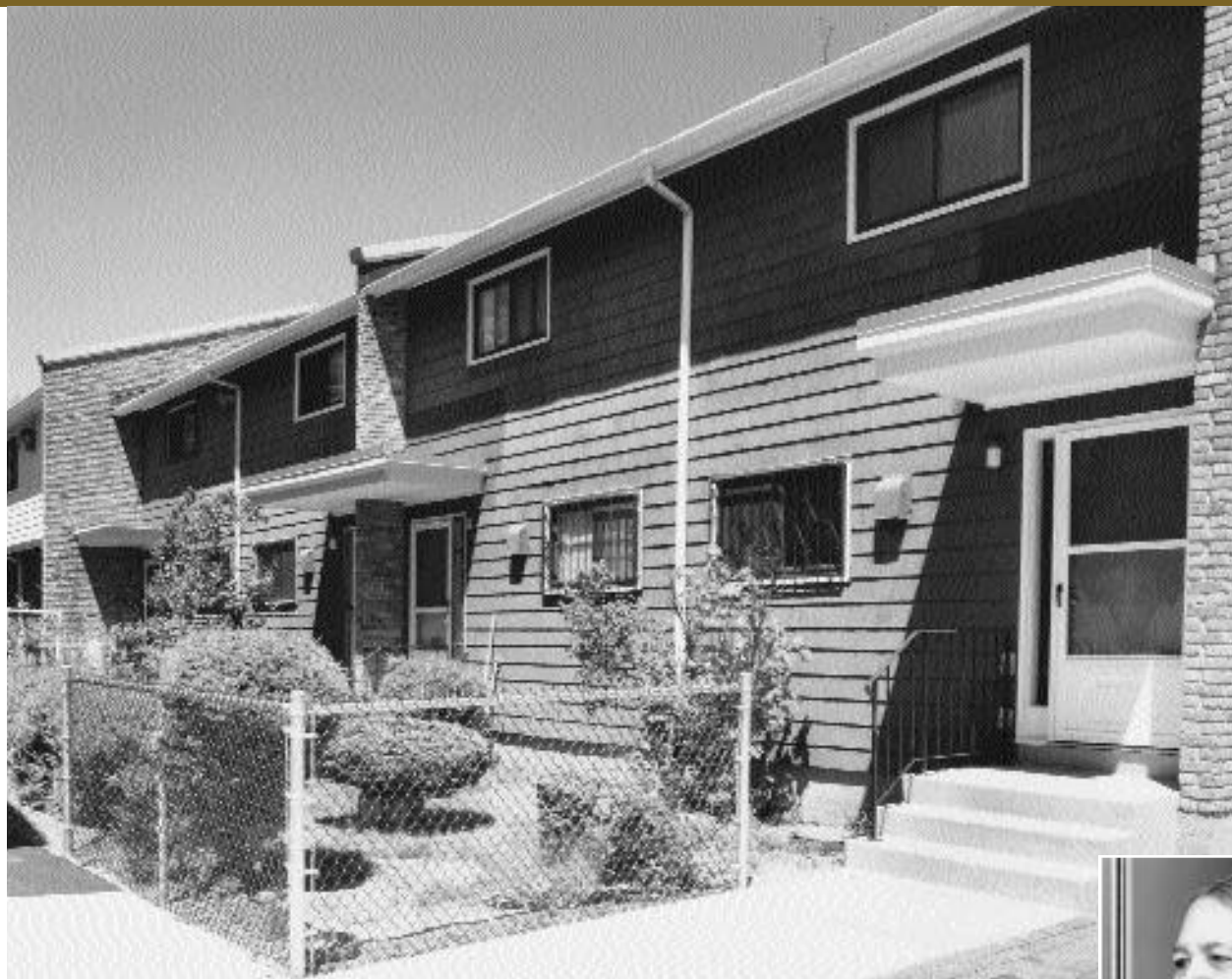
MARKSDALE GARDENS, ROXBURY

"I'VE LIVED HERE ABOUT THIRTY YEARS. I STARTED THE TENANTS' GROUP BECAUSE THE PROPERTY WAS GOING DOWNHILL. RATHER THAN MOVE AWAY AND LEAVE SOMETHING TO GO DOWN THE DRAIN, YOU SAY, 'WELL, I THINK I'LL STAY HERE AND SEE WHAT I CAN DO FOR IT.'