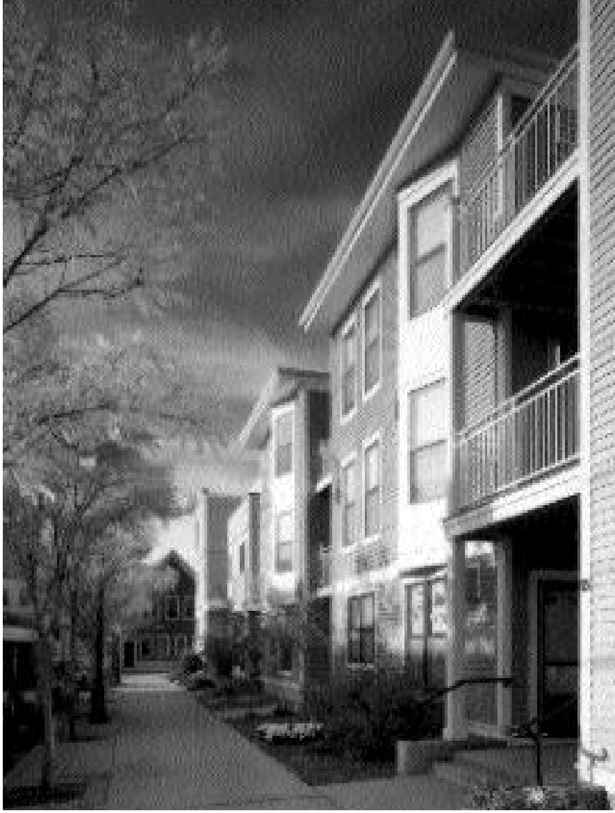
AUBURN COURT, CAMBRIDGE

two decades later that vision has been realized to a very substantial degree.