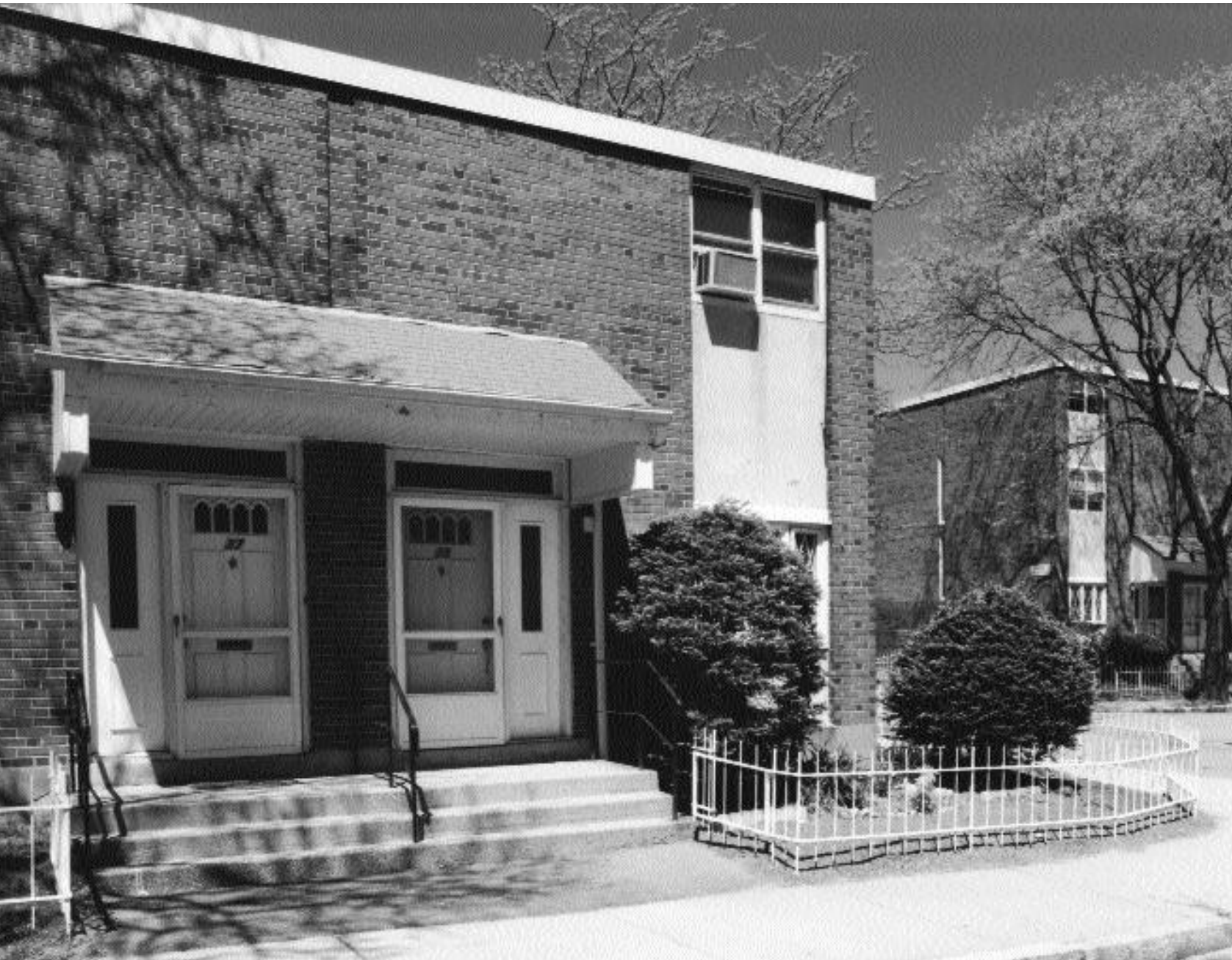
CHARLAME PARK HOMES, ROXBURY