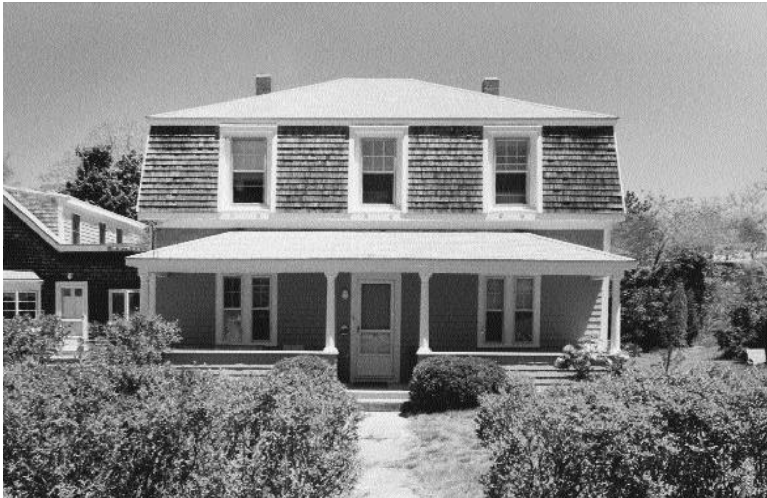
CANAL STREET HOUSING, ORLEANS

and the Commonwealth has been a real partner in that effort. The Department of Housing and Community Development (DHCD) has pioneered the use of general obligation bond proceeds to endow the Housing Innovations Fund (HIF) and Facilities Consolidation Fund (FCF) programs, which are the financial stimuli for development of this service-enriched housing. Regularly funded by the Legislature, the HIF and FCF programs have now provided $140 million in capital to support the development of this crucial housing. Most importantly, these programs are flexible and responsive to the needs of both the developers and their constituencies. When housing for people with AIDS and HIV became an issue, for example, the HIF program responded promptly with a set-aside of funding to help produce appropriate housing opportunities. To date, the HIF and FCF programs have helped the non-profit development community create over 9,190 units of housing for the Commonwealth's most vulnerable citizens. ▼