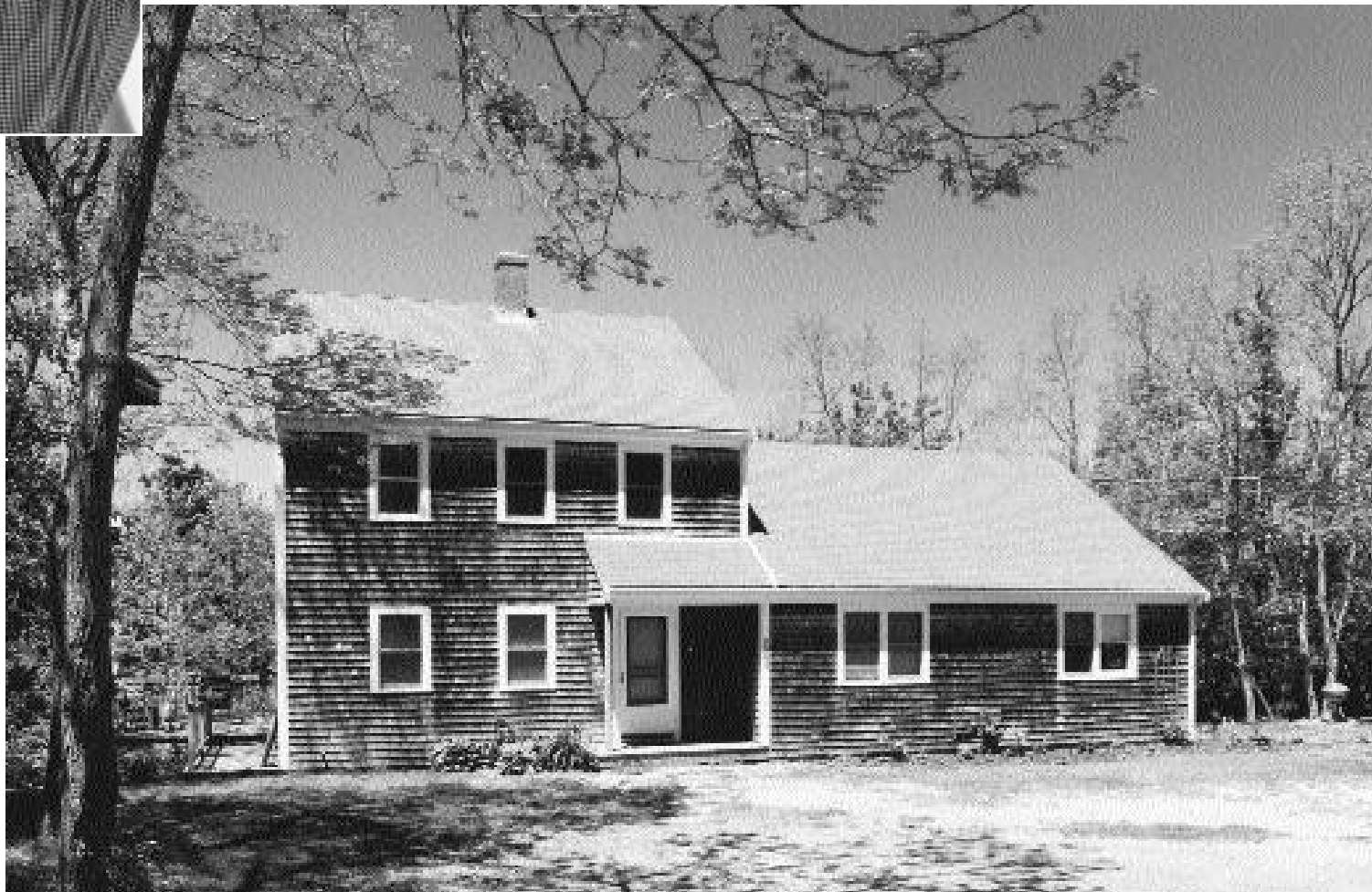
EASTHAM DUPLEX, EASTHAM

GWEN PELLETIER, LOWER CAPE COD COMMUNITY DEVELOPMENT CORPORATION