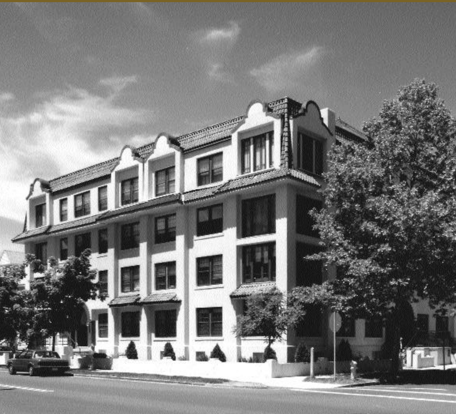
KENWYN APARTMENTS, SPRINGFIELD