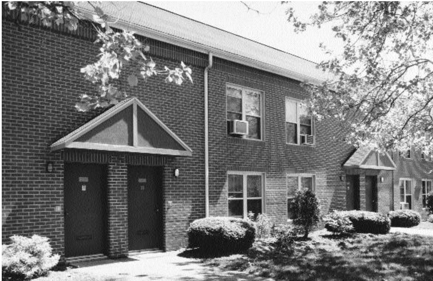
NORTH CANAL APARTMENTS, LOWELL

within two years, HUD agreed to sell Methunion and Marksdale to their residents, setting in motion a process that has culminated in HUD using the experiences forged in Boston to divest itself nationwide of the remainder of its foreclosed multi-family rental portfolio. The tenacity and savvy demonstrated by the leaders of Marksdale and Methunion illustrated clearly how much leadership potential existed, and could be tapped, in those developments. CEDAC has built on its experience with those two pioneer properties to assume a national leadership role in shaping federal policy to support the conversion of absentee-owned rental housing to ownership by community-based non-profit developers or resident groups.