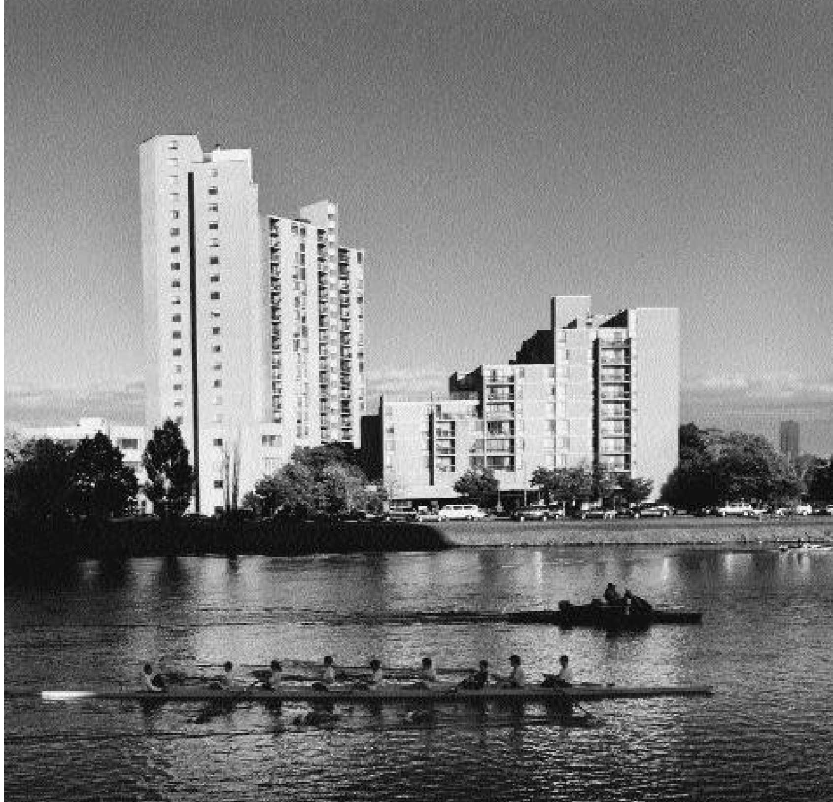
808 MEMORIAL DRIVE, CAMBRIDGE