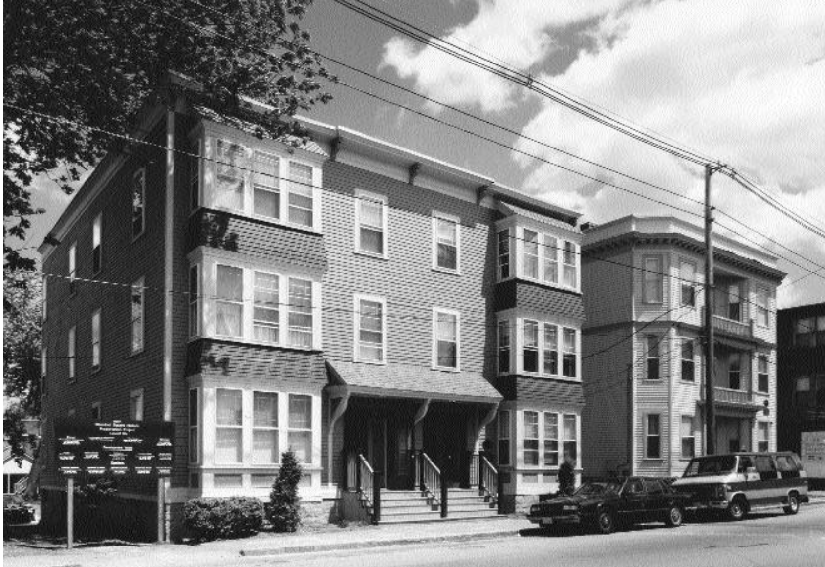
CHESTNUT SQUARE, LOWELL

ironically, the success of non-profit developers has created real competition in their neighborhoods for the remaining development opportunities. The appeal of these neighborhoods, in no small part because of the catalytic role played by non-profit developers, has spurred vigorous interest from private developers to produce residential development at market prices. As the non-profit development industry enters the new century, it confronts the challenge of balancing the benefits of attractive, vibrant neighborhoods with the desire to maintain their economic and social diversity. ▼