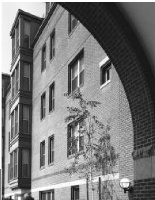
2 VIEWS OF LANGHAM COURT, SOUTH END

nonprofit, community-based development organizations already existed then, and some had by the mid-1970s already shown the ability to amass the political and financial resources needed to build and rehabilitate substantial amounts of low-income housing. But those neighborhoods advocated for the creation of an infrastructure at the state level that would provide financing and technical assistance for non-profit developers across the Commonwealth. By 1978 CEDAC came into existence as a part of that infrastructure, which would strike policy makers across the country as the most dramatic commitment by any state to community-based development as a critical tool for rebuilding communities adversely affected by poverty and blight.