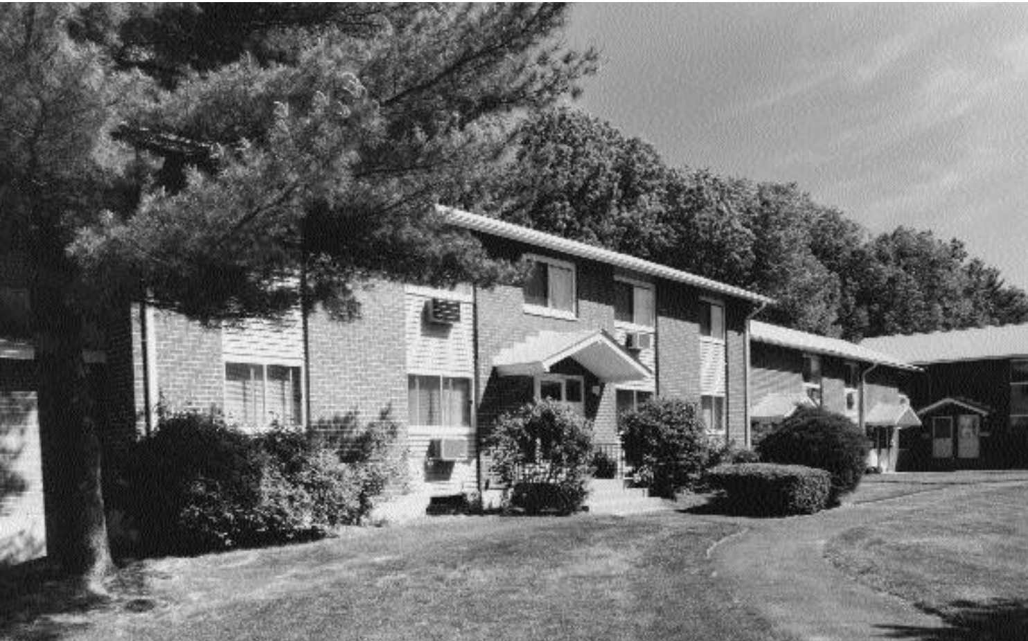
ALLEN PARK, SPRINGFIELD

the quiet, but firm, determination expressed by the residents' organizations at Marksdale and Methunion convinced CEDAC staff that resident ownership could be viable, if the underlying economics of the properties were sound, if the residents' board of directors received a full grounding in the rights and responsibilities of ownership, and if CEDAC helped surround the residents with a team of real estate professionals who could complement the tenants' political clout and integrity. CEDAC worked with Marksdale and Methunion to put together a financial plan that showed HUD how the residents would finance the necessary improvements to the properties and manage the developments.