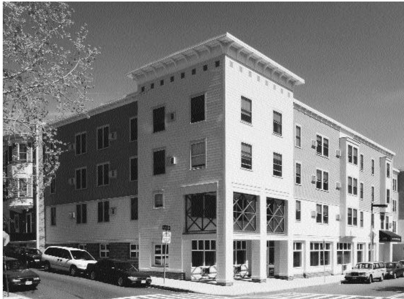
NATE SMITH HOUSE, JAMAICA PLAIN

SO CDCs turned to the role of housing developer, becoming in essence the developer of last resort for neighborhoods which desperately needed reinvestment. And they have been successful, in many cases beyond their wildest dreams. Non-profit developers have built impressive portfolios of real estate. They have stabilized multi-family rental housing, and built new stock. They have turned abandoned houses into ownership opportunities. CEDAC has worked with its partner agencies at the state level—the Department of Housing and Community Development, the Massachusetts Housing Finance Agency, and the Massachusetts Housing Partnership Fund—to focus resources in support of the non-profit development agenda as an important element of Massachusetts’ system for production of affordable housing. Twenty years ago lenders and investors viewed CDCs with suspicion and mistrust; now they compete aggressively for the non-profit development business. And with the residential renaissance have come commercial and retail market opportunities which CDCs have also pursued successfully.