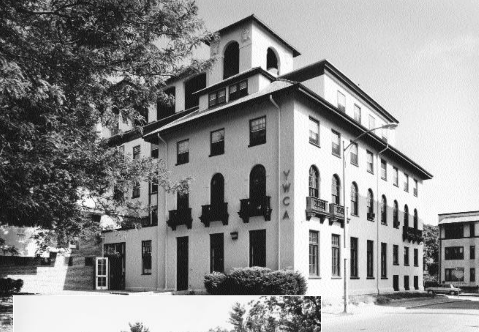
YWCA HOUSING, CAMBRIDGE