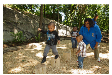
2018 Let's Take It Outside Training

Did you know that on average, American children under the age of 8 spend over two hours each day in front of a screen? As a result, children are spending less and less time outdoors. Early education and care environments are important places for providing children with the opportunity for outside play, yet many programs struggle with adequate space that is enriching and promotes children's connection to nature.