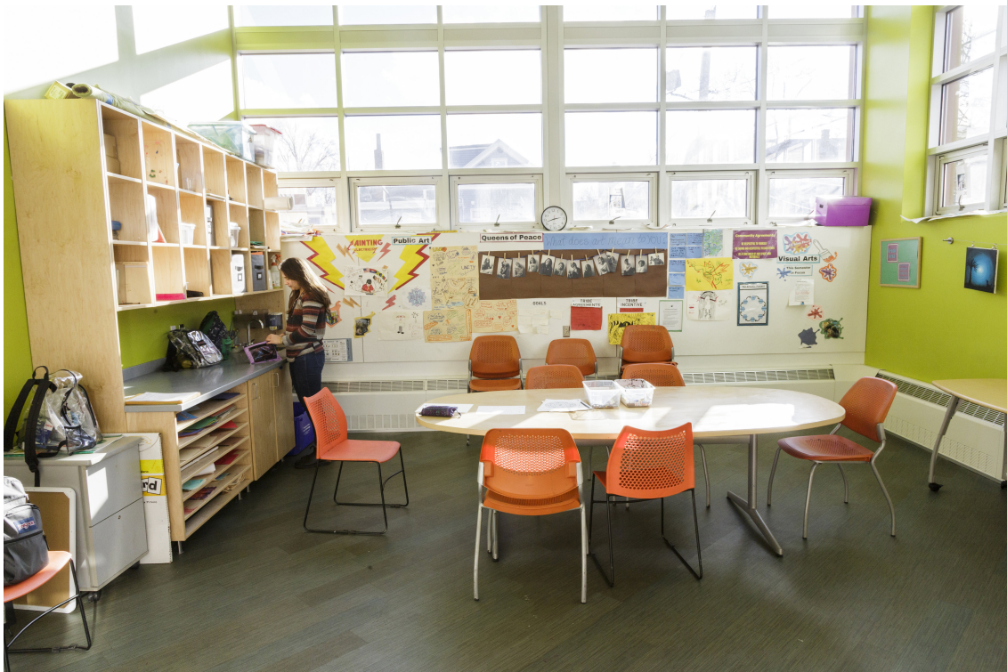
One of CAC's newly renovated classrooms