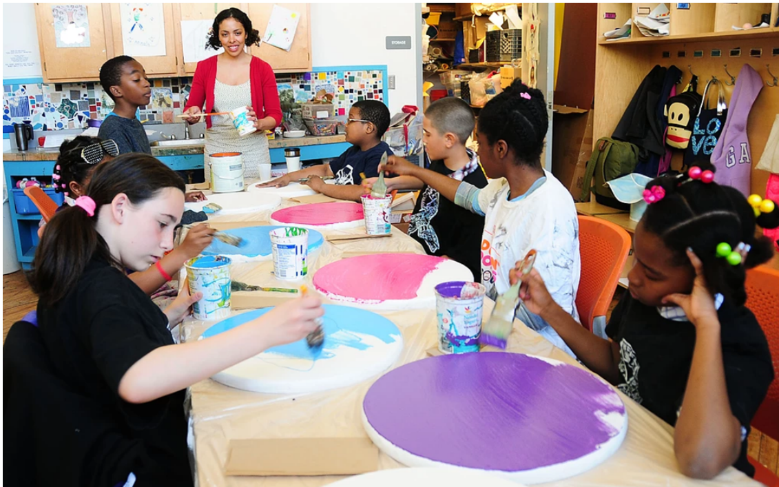
Community Art Center's school-age program, Cambridge