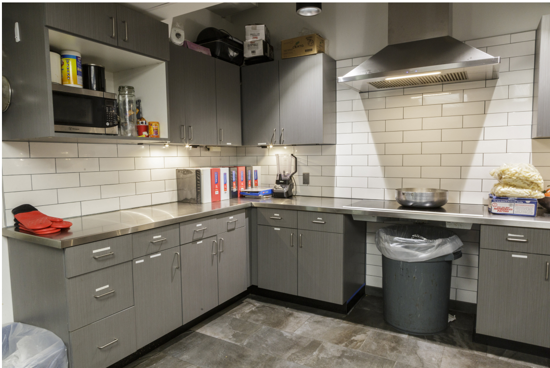
This updated kitchen serves up to three meals a day to children in CAC's school-age program.