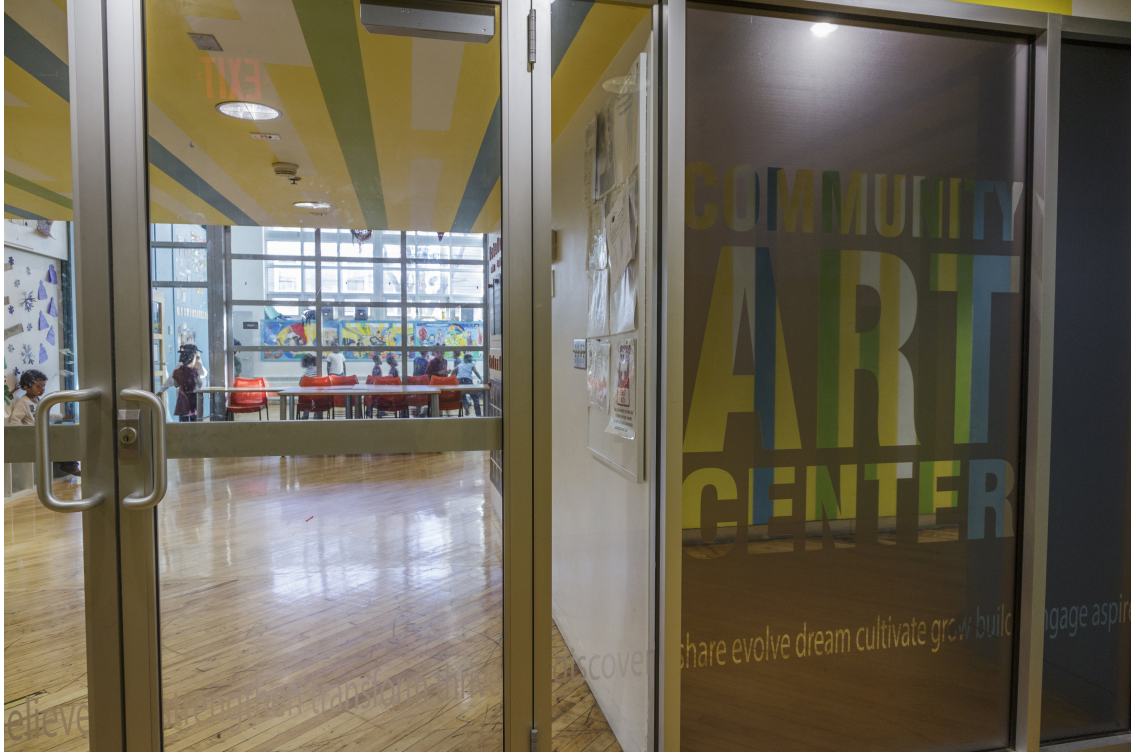
Community Art Center received a $750,000 Early Education and Out of School Time Capital Fund award in 2016.

These important upgrades ensure that CAC can continue to offer high-quality afterschool well into the future as it celebrates 80 years of programming for Cambridge's children.