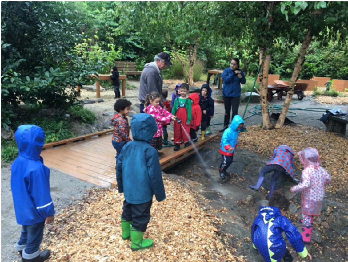
Mass Audubon's "Nature Nook" at the Boston Nature Center