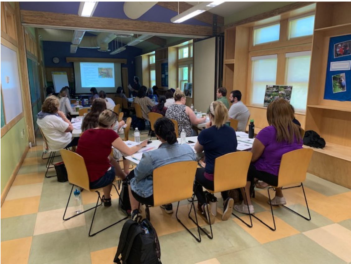
Attendees at the June 2019 "Let's Take It Outside" training listen to a presentation on the impact of outdoor play on child development.