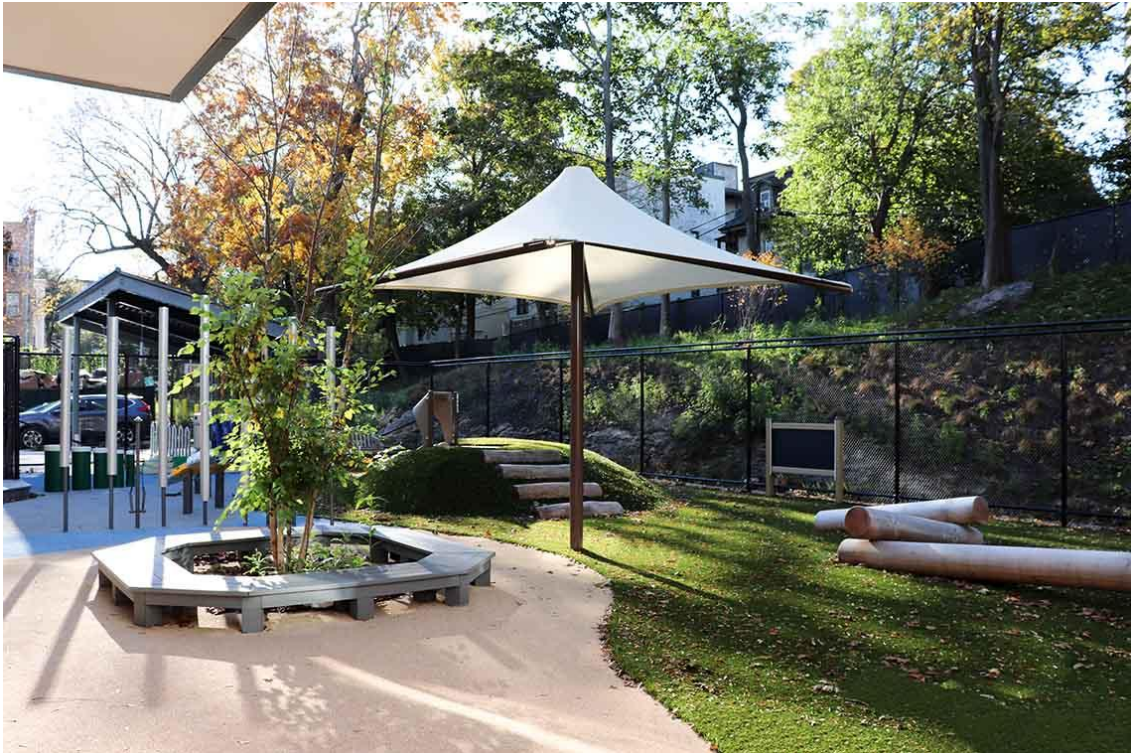
Part of the Stone House's beautiful, natural play space for children.