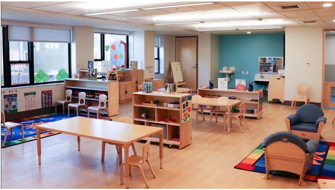
New classroom at Stone House.