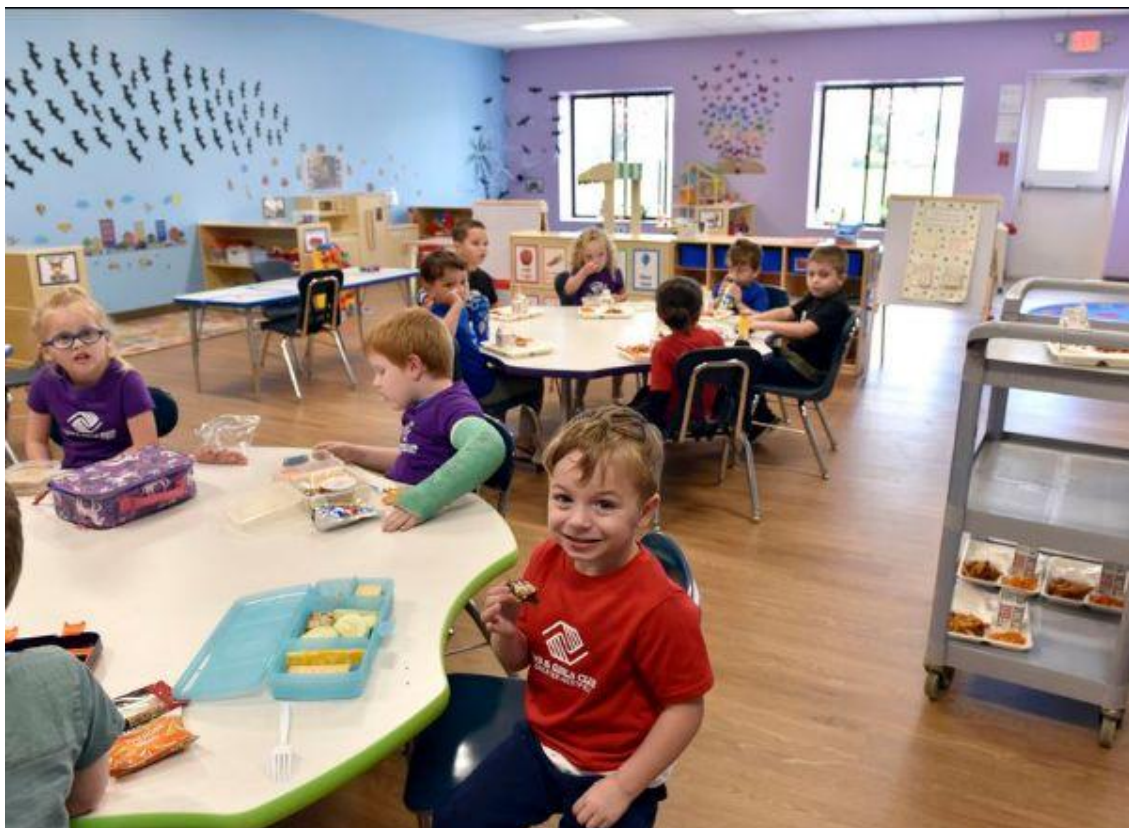
Preschool children eating lunch in their new classroom.