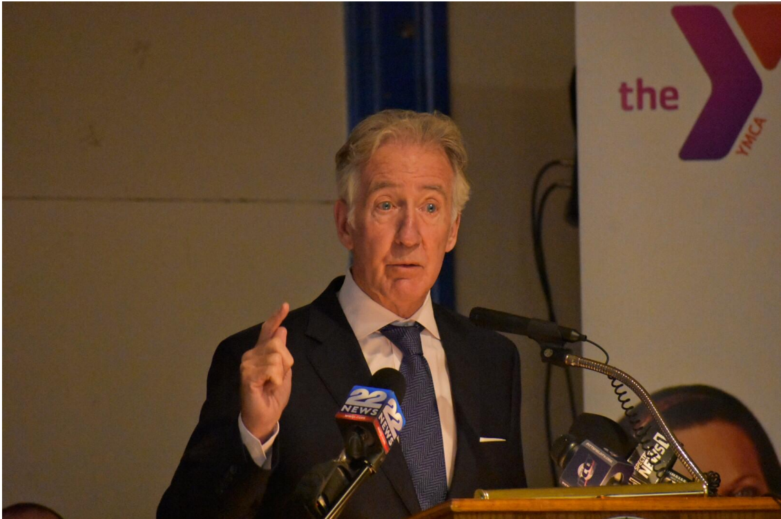
Congressman Richard Neal at the Berkshire Family YMCA's groundbreaking ceremony.