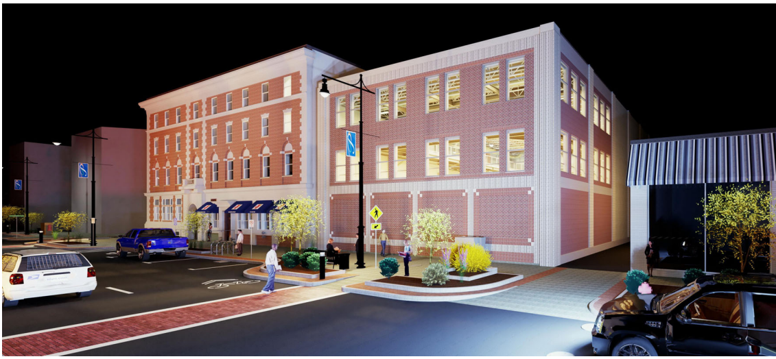
Rendering of the Berkshire Family YMCA's Pittsfield branch addition, which broke ground in November.