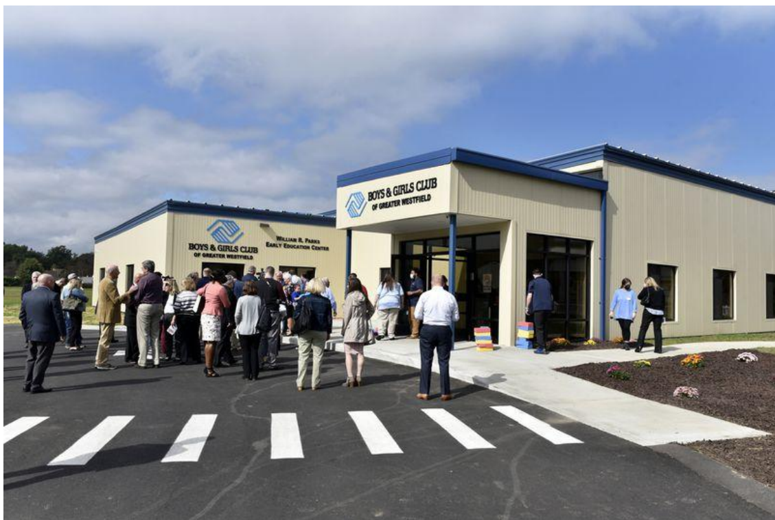
Attendees celebrating the new wing of the Boys and Girls Club of Greater Westfield.