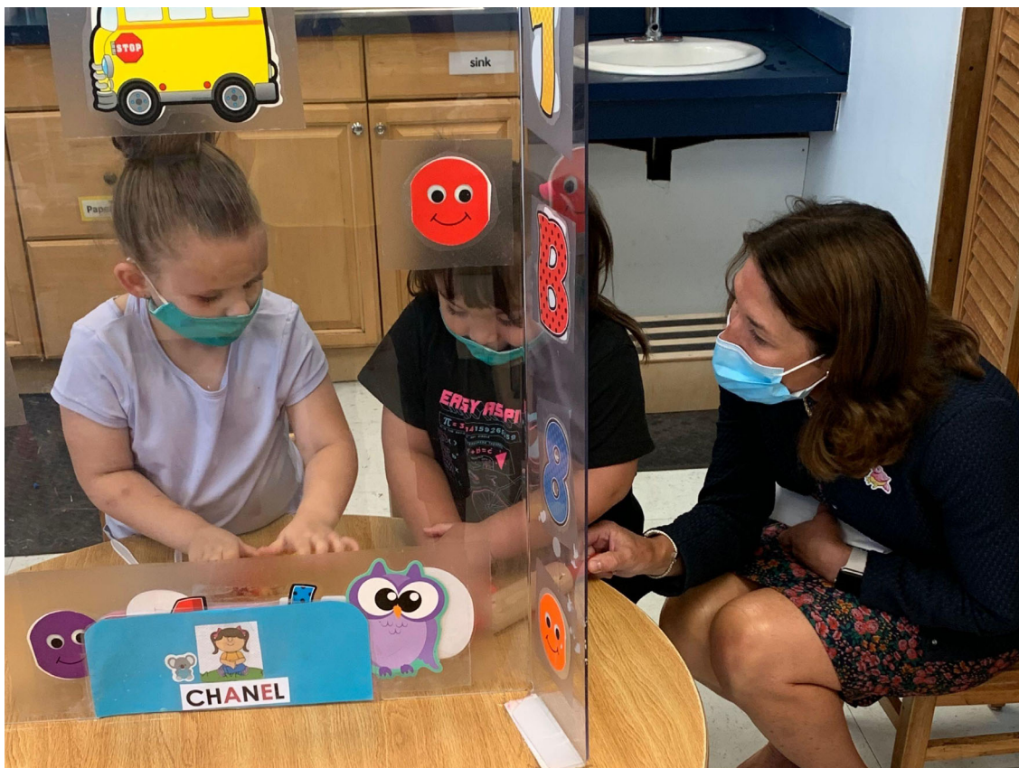
Lt. Governor Karyn Polito at the East Boston Social Centers in July 2021 to announce the EEOST Capital Fund FY21 awardees.