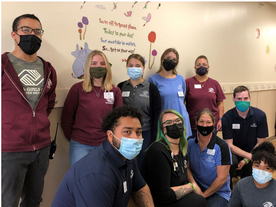
Staff at the Boys & Girls Club of Greater Westfield pose for a photo during their October "brick-breaking" event on October 13.